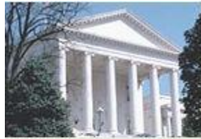
The State Capitol is a Richmond, VA, landmark.

Registration deadline is extended to July 23