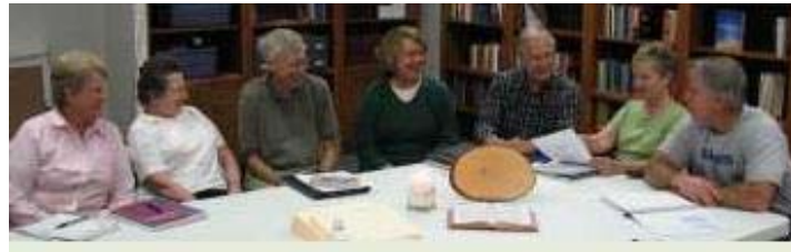
PHOTO: BeFrienders and program leaders at St. Paul UCC gather around the tree ring and Bible during training.

More details about the workshop in Belleville are available online , or you can go directly to the online registration form .