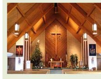
PHOTO: The beautiful sanctuary of Grace Evangelical Lutheran Church in Ripon.