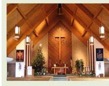
PHOTO: The beautiful sanctuary of Grace Evangelical Lutheran Church in Ripon.